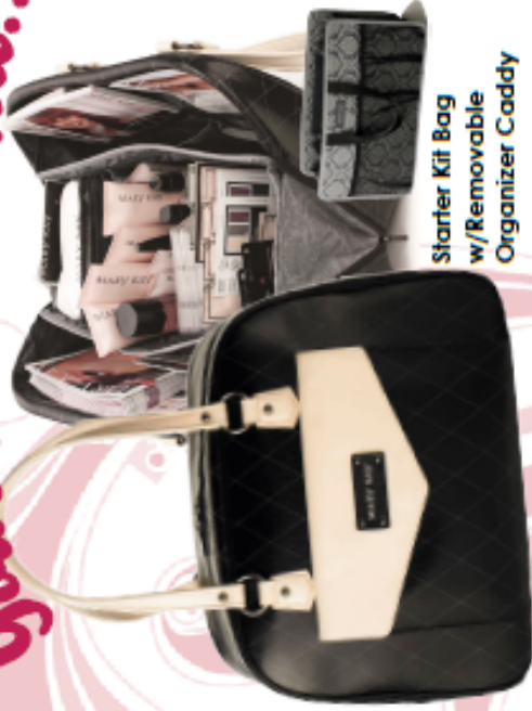
Starter Kit Bag w/Removable Organizer Caddy