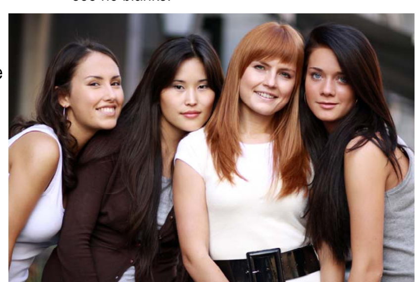
Page Created for the clients of www.unitcommunity.com