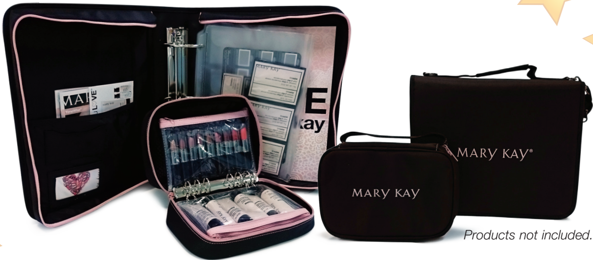
Products not included.

You can earn these GREAT GIFTS* this Quarter. Check out Mary Kay's sensational Sample Organiser and the Show 'n' Go/Foundation Organiser.