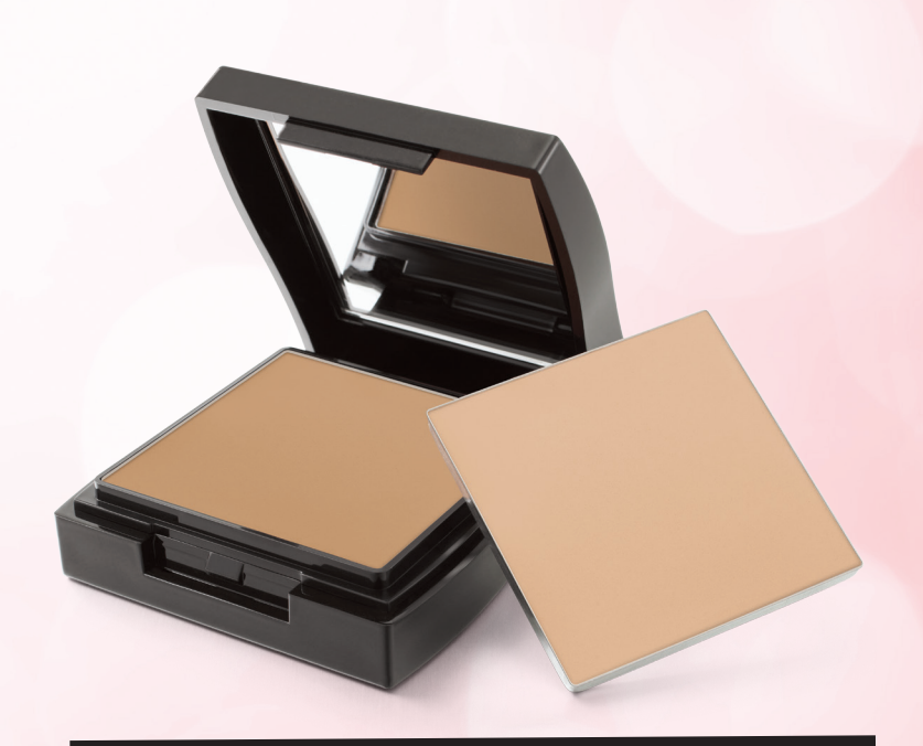
NEW! Endless Performance<sup>™</sup> Crème-to-Powder Foundation $30/NZ$38

*Results based on an independent clinical study with 20 panelists