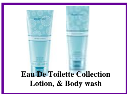
Eau De Toilette Collection Lotion, & Body wash