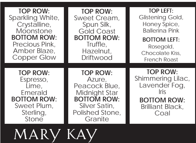
Display Tray #3: Mineral Eye Colors