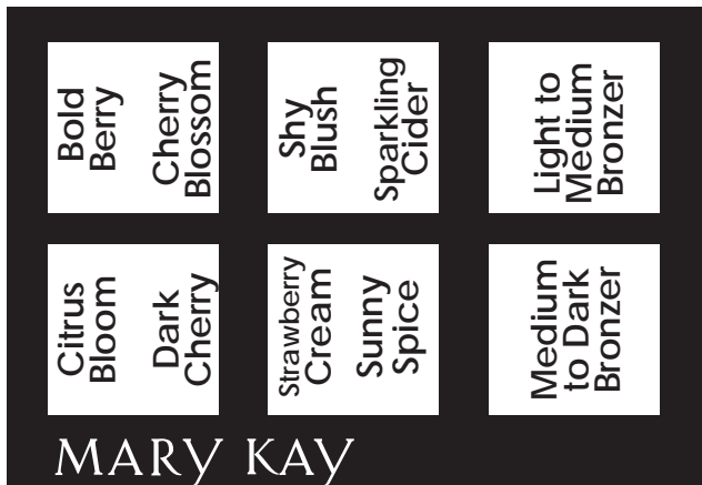
Display Tray #2: Mineral Cheek Colors