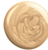
cream and sugar