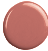
café au lait