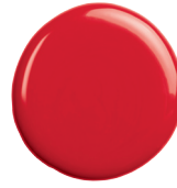
rock 'n' red