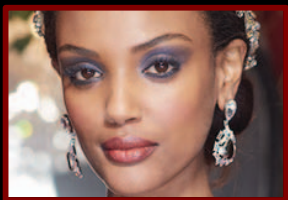
Smokey Fantasy Eyes