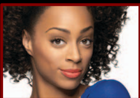
5 Minute Face