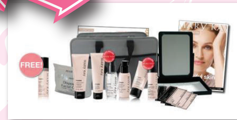
TimeWise® Skincare Bundle Total Retail Value of $360.50 NZ$416