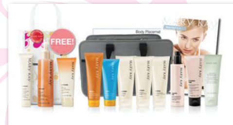
Mary Kay® Body Bundle Total Retail Value of $343 NZ$391