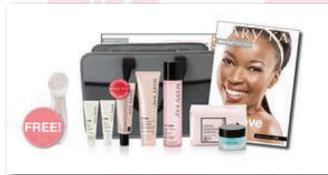
Mary Kay® Must Have Bundle Total Retail Value of $324 NZ$374.50