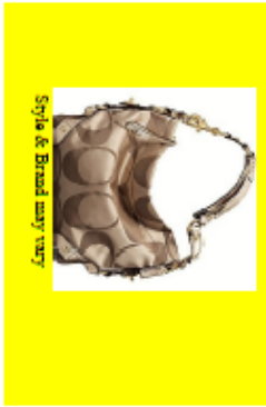
Style & Brand every way