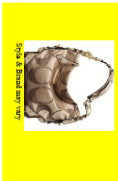
Style & Brand every way