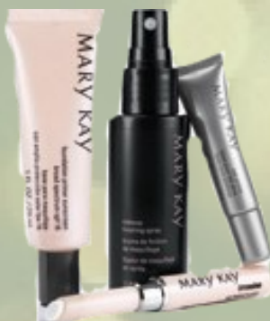
Lasting Looks $69 Mary Kay Eye Primer Lip Primer Foundation Primer Makeup Finishing Spray