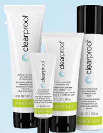
Clear Proof Acne System- The Go Set $20