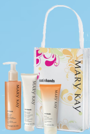
Satin Hands Set $34