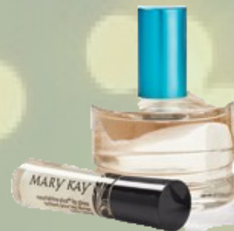
Cool & Crisp $34 Simply Cotton Eau de Toilette Icicle Nourishine Lip Gloss