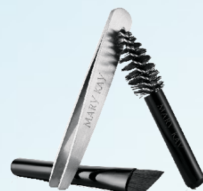
Mary Kay Brow Tools $4