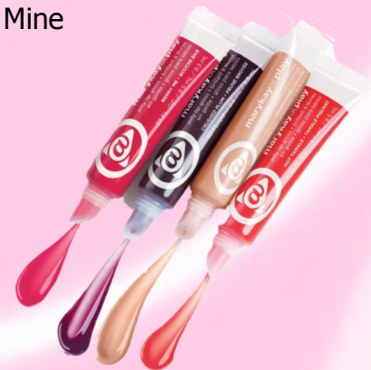
Jelly Lip Gloss Berry Me Hot Tamale Teddy Bare Crushed Plum