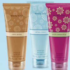
Eau de Toilette Shower Gel $15