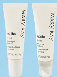
Satin Lips Set $20