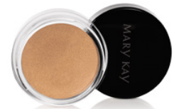
Cream Eye Color