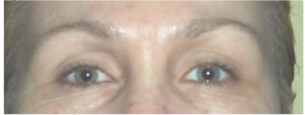
One Eye With