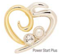
Power Start Plus

Achieving PS in your very first month is a tradition in Mary Kay! You can do it, too! You will be so proud to earn your Perfect and Power Start pins! And watch for your name in the newsletter!