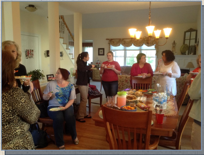
Consultants Only Fun Night Out!