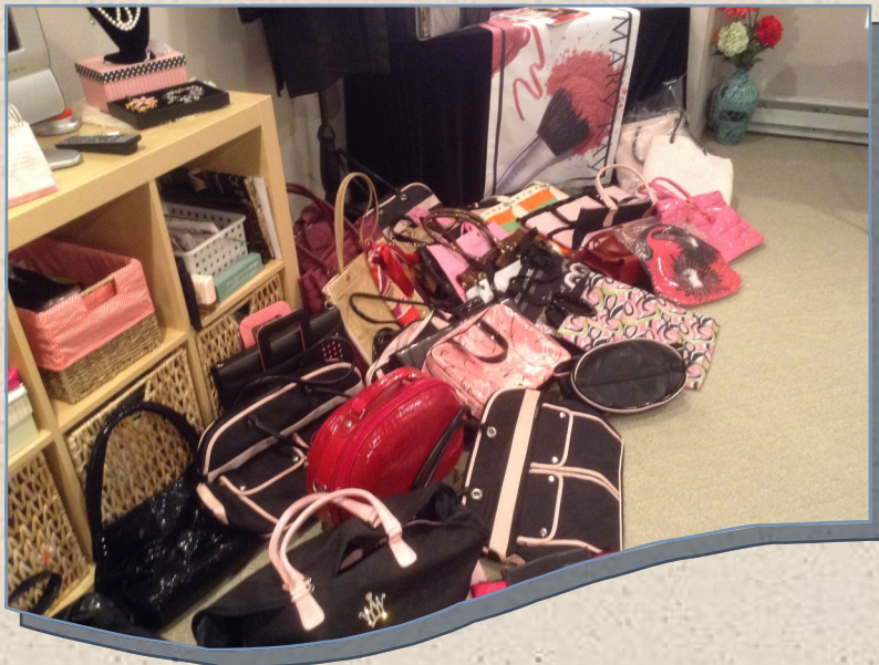
Consultant Only Night!! Celebrating & spending Mary Kay Bucks!!