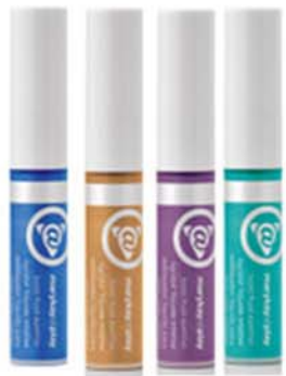
Blue My Mind, Gold Metal, Hello Violet & The Real Teal

Triple Layer Tinted Balm, $10 Atomic Red, In the Plum, Orange You Lovely, Pink Again