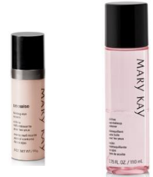
Firming Eye Cream Oil Free Eye Makeup Remover