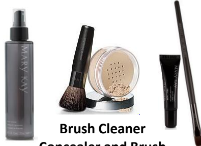
Brush Cleaner Concealer and Brush Mineral Powder Foundation, Brush