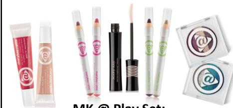
MK @ Play Set: Choose 1 each from the Lip Jelly, Lip Crayon, Eye Crayon and Baked Eye Trio sets and a Mascara