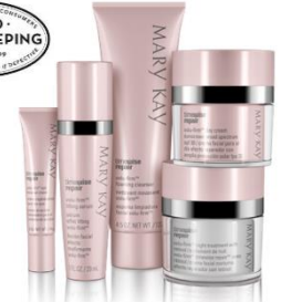
TimeWise Repair Volu-firm Set *This square alone fills Queen Package*