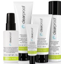
ClearProof Acne System ClearProof Pore Purifying Serum