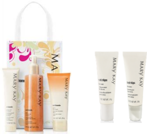
Satin Lips Set Satin Hands Set