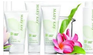
Botanicals Skin Care Set: Cleanse, Freshen, Mask, Hydrate