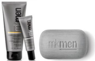
MK Men's Set: Face Bar Advanced Eye Cream Advanced Facial Hydrator SPF 30