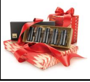
Velocity® For Him He will be sporting a big smile when he receives this super cool Velocity For Him Cologne