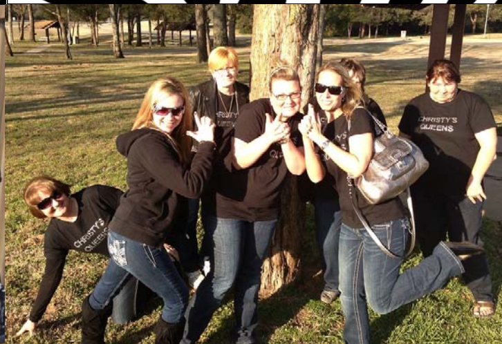
Queens Road Trip