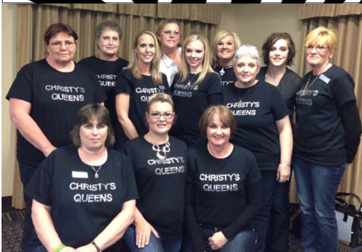
Our Queens at the Color With Confidence Workshop, Rogers, AR