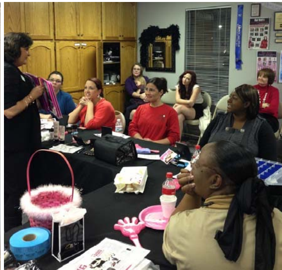
We love Our Mary Kay