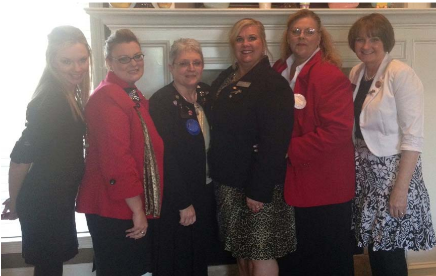
Star Consultant Awards Dinner at Christy's