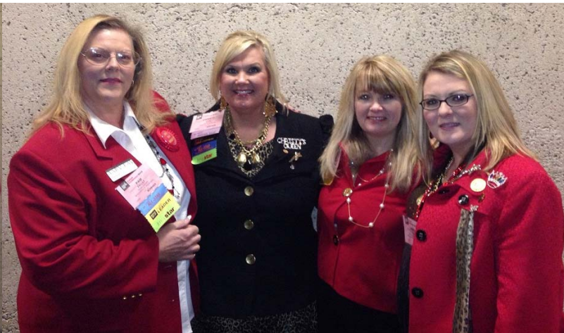
Career Conference Dallas, TX 2013