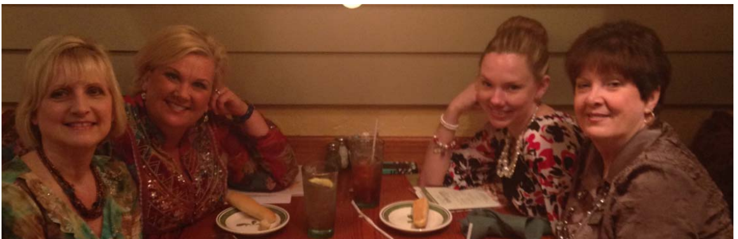
Congratulations to the Stars!