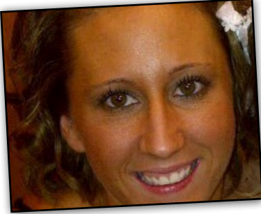
QUEEN OF SHARING