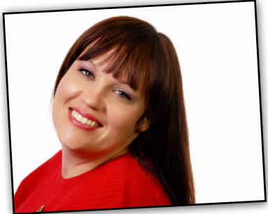
QUEEN OF INTERVIEWS