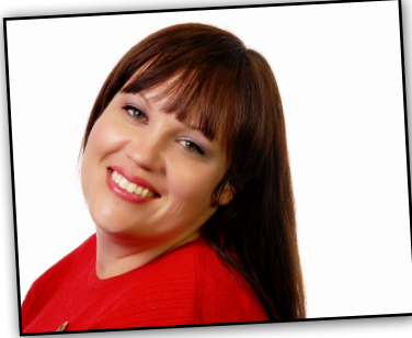
QUEEN OF FACES (30+)