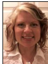
Carrie Peoples Catchpole Unit