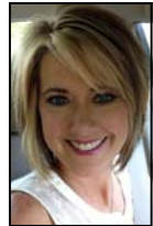
Stephanie Harris Moore Unit