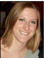
Lark Engen Showers Unit