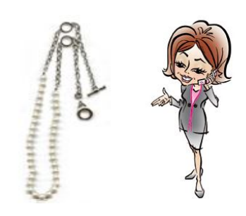
Add your first new Qualified Team Member and earn your Pearls of Sharing Necklace.