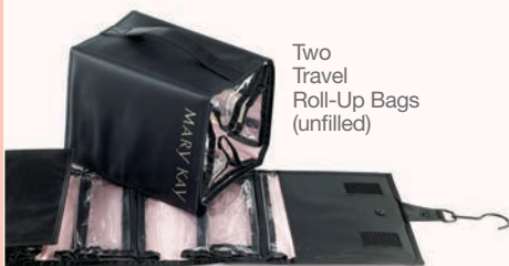
Two Travel Roll-Up Bags (unfilled)

Plus , earn a BizBuilder Bucks $125 wholesale product credit.**