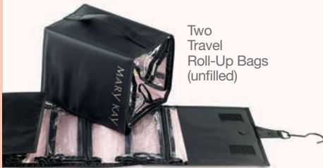
Two Travel Roll-Up Bags (unfilled)

Plus, earn a BizBuilder Bucks $50 wholesale product credit.**