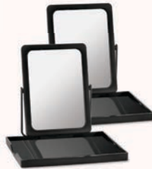
Two Mirrors With Trays