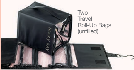
Two Travel Roll-Up Bags (unfilled)

Plus, earn a BizBuilder Bucks $80 wholesale product credit.**