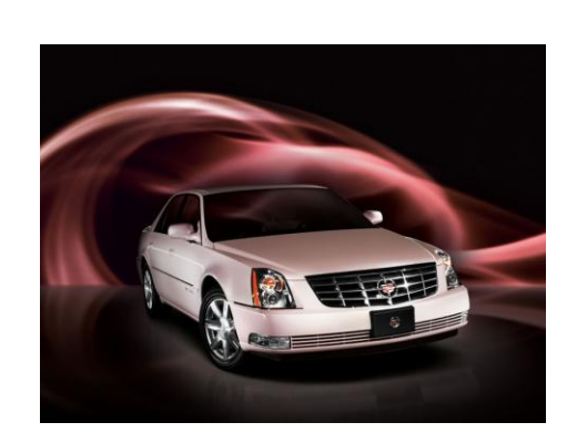
Director Cars: Pink Cadillac – DTS, or CTS

Insert a picture of you with a MK car you earned or are working to earn or of your director or recruiter with her car!