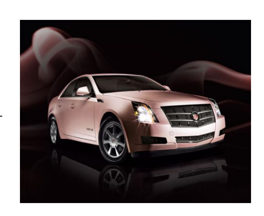
Mary Kay has the largest fleet of cars on the road today next to the United States Government!