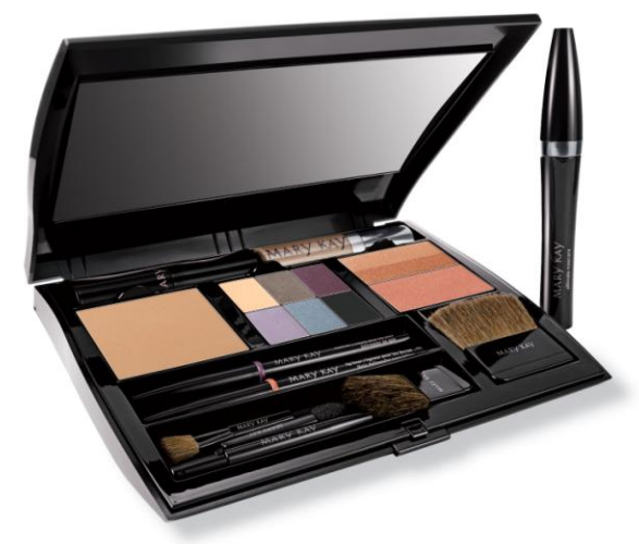
"If it's FREE it's for me!" & Special Gifts for HOSTESSES ONLY!