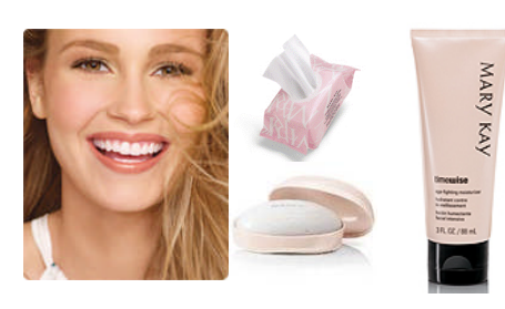
40 year olds ~ Prevention is a must!