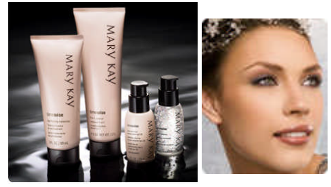
50 year olds ~ Repair, Replenish, Rejuvenate!