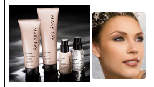
50 year olds ~ Repair, Replenish, Rejuvenate!