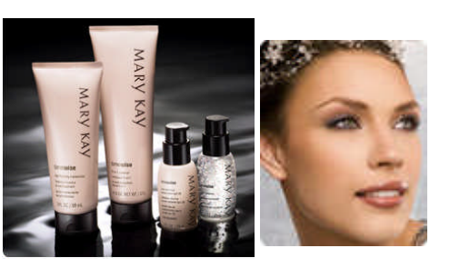
50 year olds ~ Repair, Replenish, Rejuvenate!