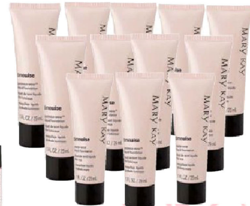
FULL-SIZE RETAIL PRODUCT

PRODUCT INCLUDED TimeWise 3-in-1 Cleanser N/D TimeWise Age-Fighting Moisturizer N/D TimeWise 3-in-1 Cleanser C/O TimeWise Age-Fighting Moisturizer C/O TimeWise Day Solution SPF 35 TimeWise Night Solution Oil-Free Eye Makeup Remover Ultimate Mascara - Black Choice of Mineral Power or Liquid Foundations