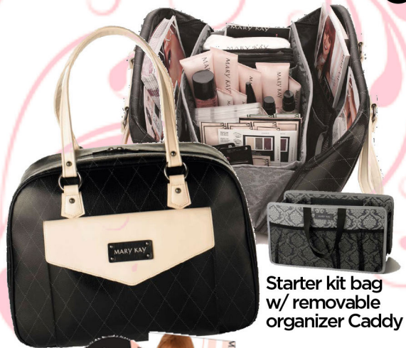
Starter kit bag w/ removable organizer Caddy