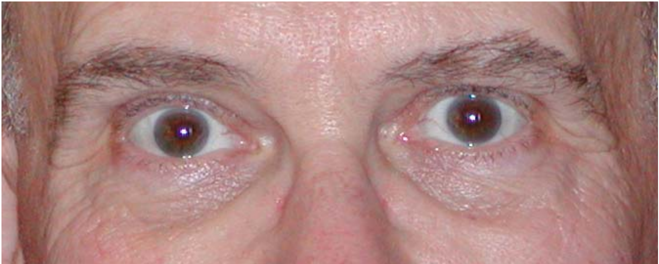
October, 2006—No eye products at all. Before picture.