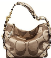
Style may vary

ALL GUESTS entered to WIN a Designer Handbag!