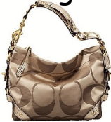
Style may vary

ALL GUESTS entered to WIN a Designer Handbag!