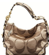
Style may vary

ALL GUESTS entered to WIN a Designer Handbag!