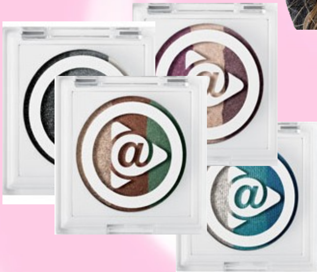
Baked Eye Trios Ocean View On the Horizon Earth Bound Tuxedo