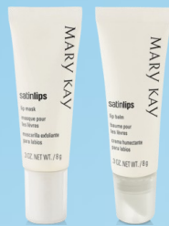
Satin Lips Set $18