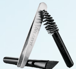
Mary Kay Brow Tools $4