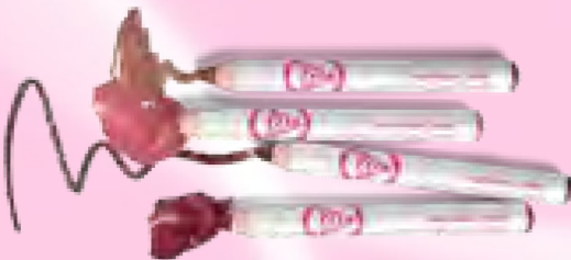
Lip Crayons Candied Apple Perfect Pink Toasted Violet Love