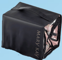
Travel Rollup Bag $35