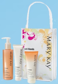
Satin Hands Set $34