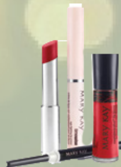
Viva Red $67 Lip Primer Firecracker Lipstick Rock'n'Red Lip Gloss Clear Lip Liner