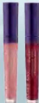
Limited Edition Mary Kay Glossy Lip Stain $16 Enchanted Mauve Mulberry Forest