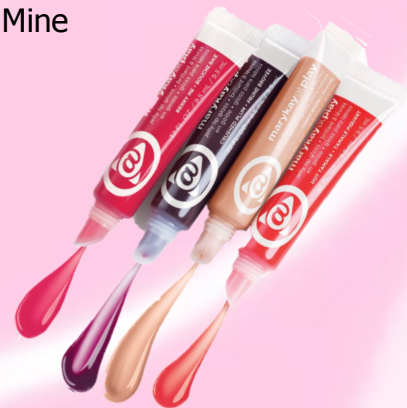
Jelly Lip Gloss Berry Me Hot Tamale Teddy Bare Crushed Plum