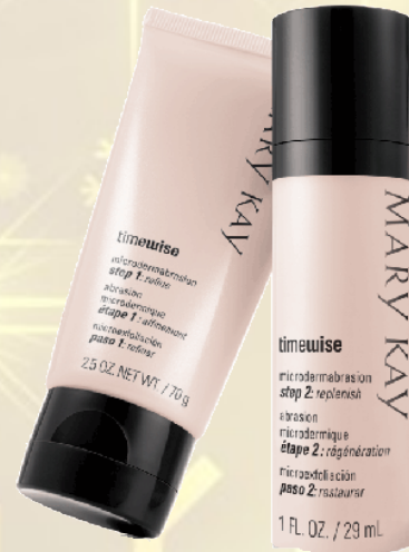
Timewise Microdermabrasion Set $50 Step 1 Refine Step 2 Replenish