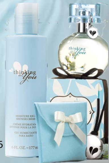
Thinking of You Set $55 Eau de Parfum Moisture Rich Shower Gel Eau de Parfum Pendant