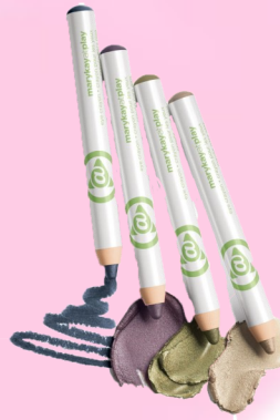
Eye Crayons Purple Smoke Green Tea Perfect Pink Gold Mine