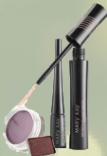
Plum Perfect $47 Mineral Eye Color in Truffle Cream Eye Color in Violet Storm Lash Love Lengthening Mascara and Liquid Eyeliner in Black