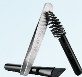
Mary Kay Brow Tools $4