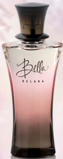
Bella Belara Eau de Parfum $38