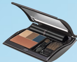
Color Compact (unfilled) $18