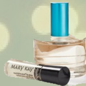
Cool & Crisp $34 Simply Cotton Eau de Toilette Icicle Nourishine Lip Gloss