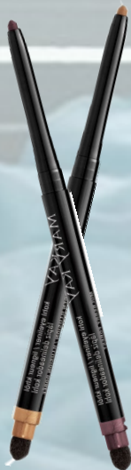
Limited Edition Mary Kay Kohl Eyeliner $16 Mulberry Forest Golden Illusion