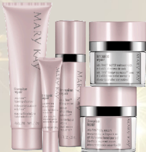
Timewise Repair Set $199 Foaming Cleanser Lifting Serum Day Cream Sunscreen Broad Spectrum SPF 30 Night Treatment with Retinol Eye Renewal Cream