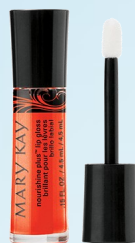
NouriShine Lip Gloss $14