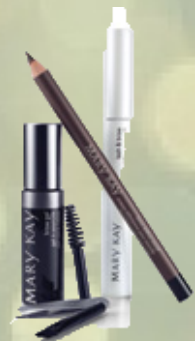
Beautiful Brows $62 Mary Kay Lash & Brow Building Serum Brow Gel, Brow Definer Pencil in Brunette & Brow tools