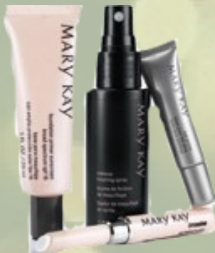
Lasting Looks $69 Mary Kay Eye Primer Lip Primer Foundation Primer Makeup Finishing Spray