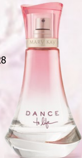
Dance to Life Eau de Parfum $50