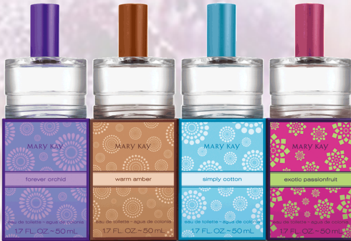
Mary Kay Eau de Toilette $20 Simply Cotton Exotic Passionfruit Warm Amber Forever Orchid