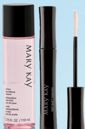
Lash Love Mascara & Eye Makeup Remover $30