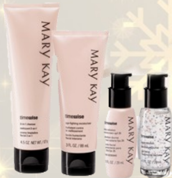
Timewise Miracle Set $90 Normal/Dry or Combination/Oily Cleanser, Moisturizer Day Solution and Night Solution