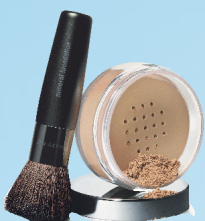
Mineral Foundation Set $28