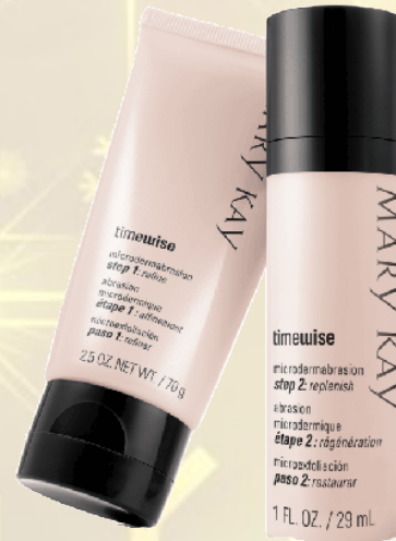
Timewise Microdermabrasion Set $50 Step 1 Refine Step 2 Replenish