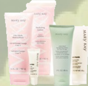
All Over Hydration Set $58 2 in 1 Body Wash & Shave Hydrating Lotion Satin Lips Lip Balm Satin Hands Hand Cream Mint Bliss Lotion for Legs & Feet