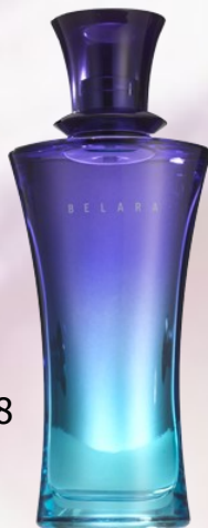
Belara Eau de Parfum $38