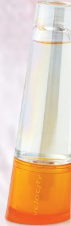
Velocity Eau de Parfum $28