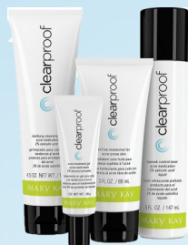
Clear Proof Acne System- The Go Set $20