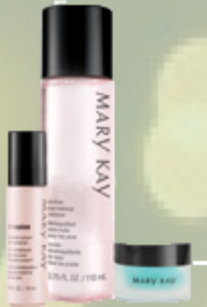
After Fiesta $67 Targeted Action Eye Revitalizer Indulge Soothing Eye Gel Oil free Eye Makeup Remover