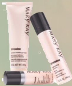
Timewise Trio $110 Timewise Firming Eye Cream Moisture Renewing Gel Mask Replenishing Serum-C