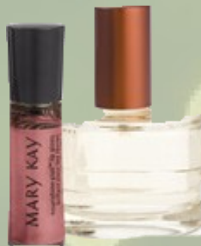
Warm & Wonderful $34 Warm Amber Eau de Toilette Café au Lait Nourishine Lip Gloss