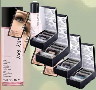
Eye Bundles in Blue, Brown, Green, and Hazel with Eye Makeup Remover $36