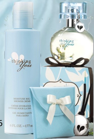
Thinking of You Set $55 Eau de Parfum Moisture Rich Shower Gel Eau de Parfum Pendant