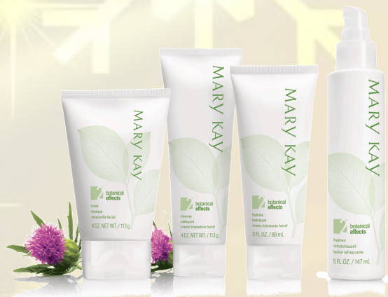
Botanical Effects Set $58 Cleanser Mask Freshener Moisturizer