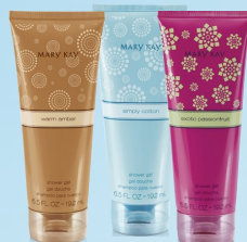
Eau de Toilette Shower Gel $15