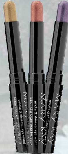
Limited Edition Smoke and Shimmer Eye Wand $14 Amethyst Smoke Golden Illusion Enchanted Mauve