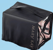
Travel Rollup Bag $35