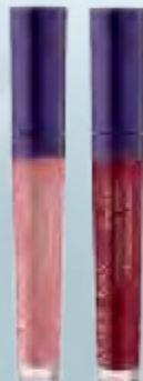
Limited Edition Mary Kay Glossy Lip Stain $16 Enchanted Mauve Mulberry Forest