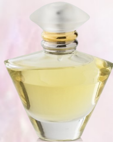
Journey Eau de Parfum $40