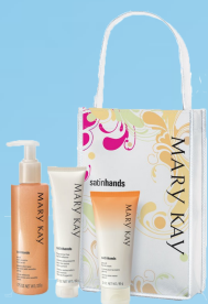
Satin Hands Set $34