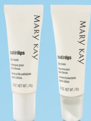
Satin Lips Set $20