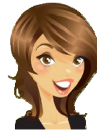
Miryam Levovitz $10,024.00