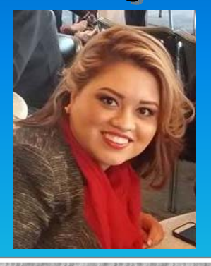
Unit Recruiting For last month