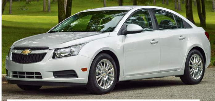
Chevy Cruze White