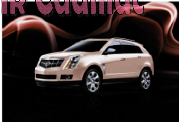
Cadillac SRX Leather Seating, Sun Roof, Remote Entry/Start