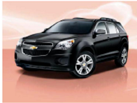
Chevy Equinox Black