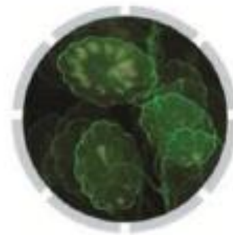
Plant Stem Cells

*Based on in vitro testing of key ingredients