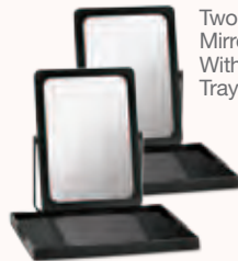
Two Mirrors With Trays