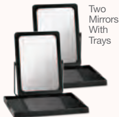
Two Mirrors With Trays