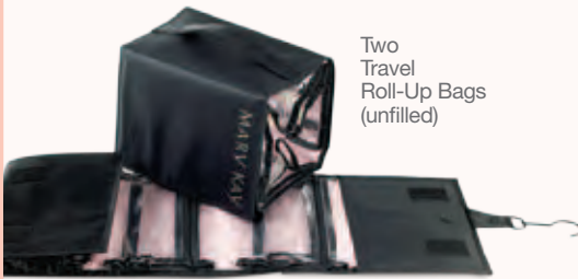
Two Travel Roll-Up Bags (unfilled)

Plus, earn a BizBuilder Bucks $100 wholesale product credit.**