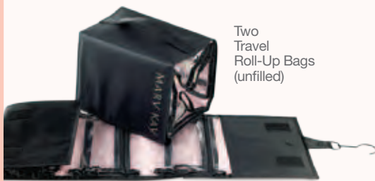
Two Travel Roll-Up Bags (unfilled)

Plus, earn a BizBuilder Bucks $80 wholesale product credit.**