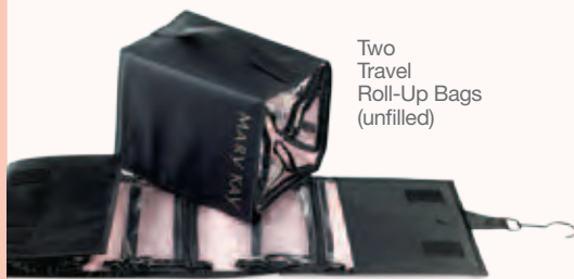
Two Travel Roll-Up Bags (unfilled)

Plus, earn a BizBuilder Bucks $125 wholesale product credit.**