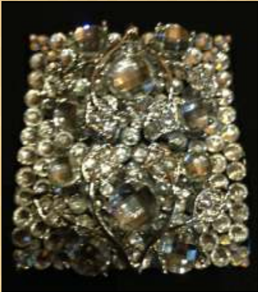
Swarovski Crystal MK Mini-Compact

Become a Sales Director by December 31, 2013