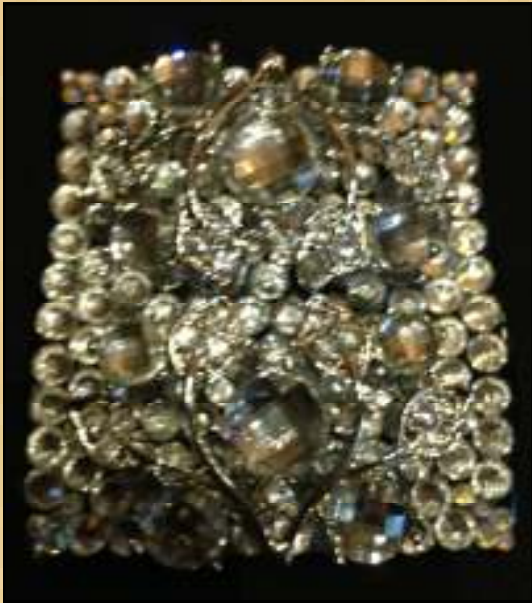
Swarovski Crystal MK Mini-Compact

Become a Sales Director by December 31, 2013