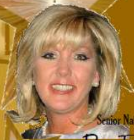
Senior National Sales Director