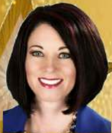
National Sales Director

Current Future Executives, Executives and Elite Sales Directors must Offspring 2 NEW Directors during the contest period to WIN!