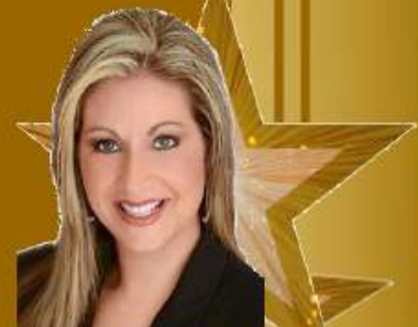
National Sales Director