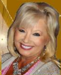
Senior National Sales Director