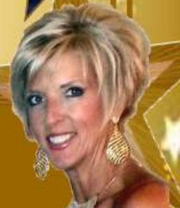
National Sales Director

*All winners must be a current Director in good standing to attend*