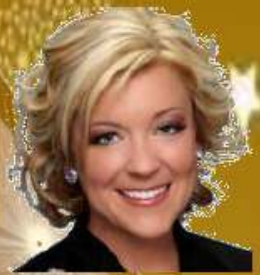
National Sales Director