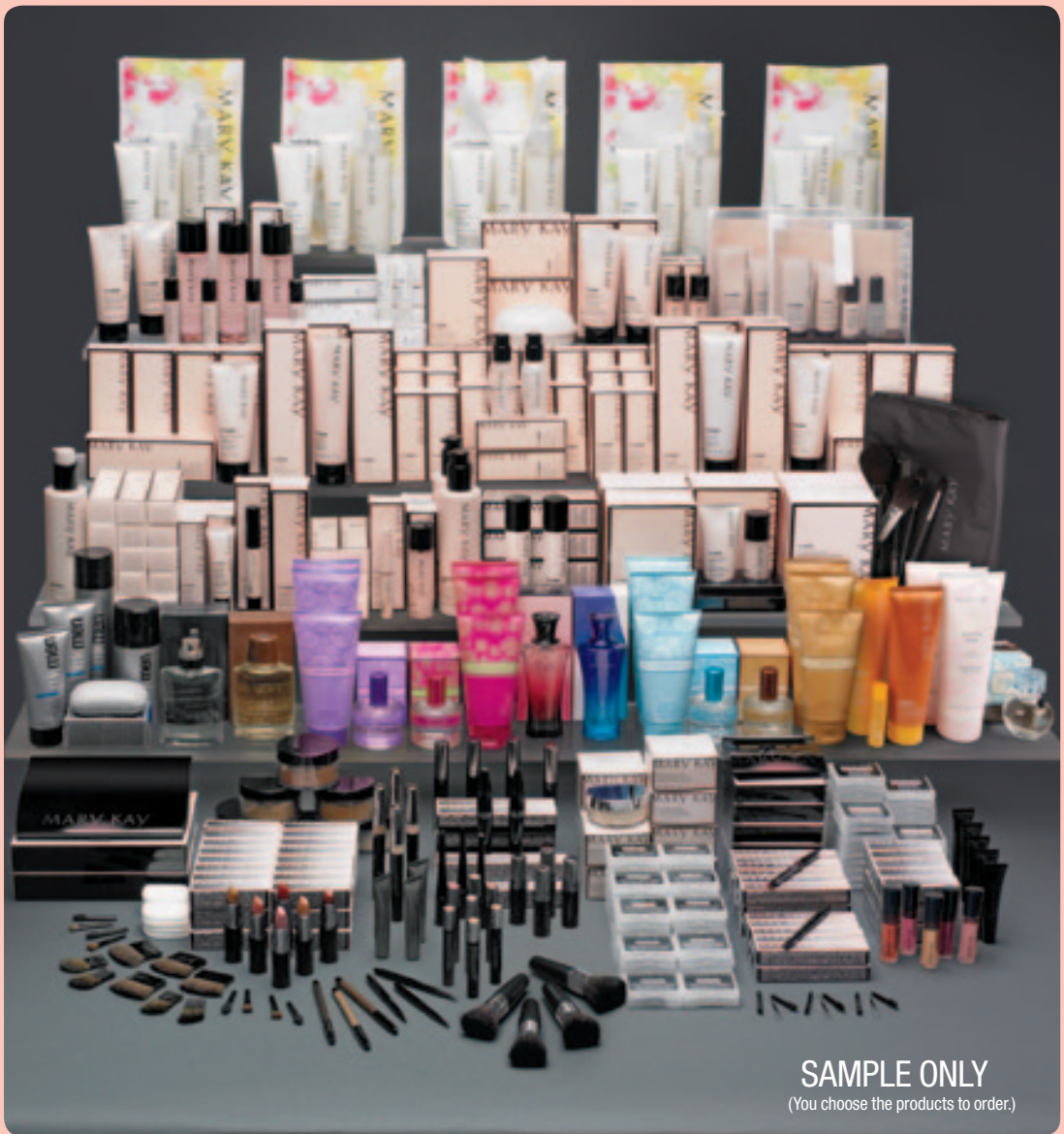
SAMPLE ONLY (You choose the products to order.)

Get your business off to a powerful start with $3,000 wholesale inventory. It gives you: