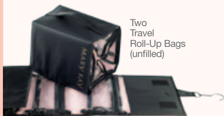
Two Travel Roll-Up Bags (unfilled)

Plus, earn a BizBuilder Bucks $100 wholesale product credit.**