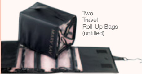
Two Travel Roll-Up Bags (unfilled)

Plus, earn a BizBuilder Bucks $80 wholesale product credit.**