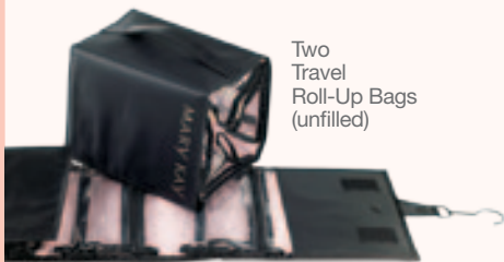
Two Travel Roll-Up Bags (unfilled)

Plus, earn a BizBuilder Bucks $50 wholesale product credit.**