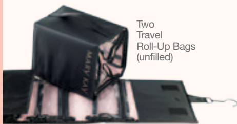
Two Travel Roll-Up Bags (unfilled)

Plus , earn a BizBuilder Bucks $125 wholesale product credit.**