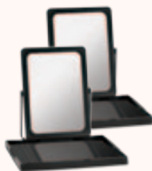
Two Mirrors With Trays