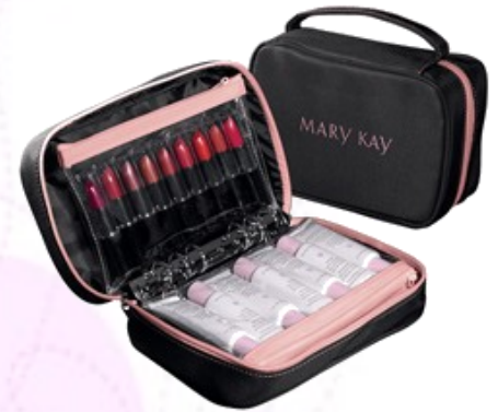
Mary Kay Rolling Tote & Show-n-Go