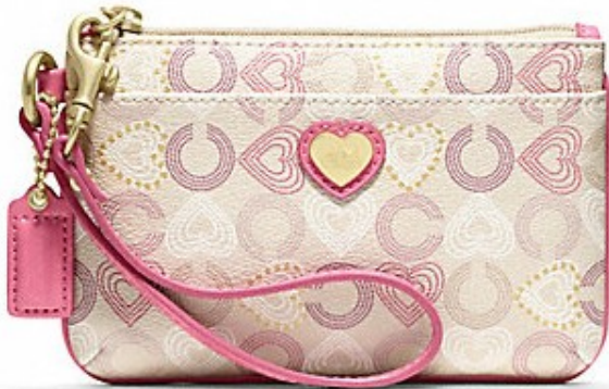
COACH Mini Wristlet