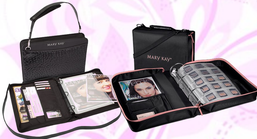
Mary Kay Business Organizer & Sample Organizer