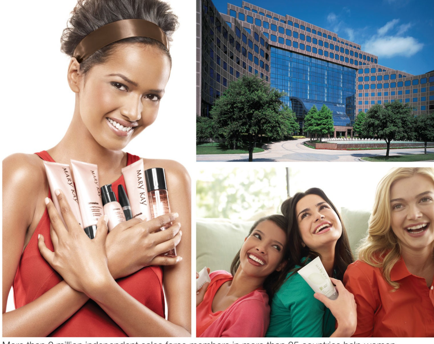
More than 2 million independent sales force members in more than 35 countries help women look and feel their best.

Cover model is wearing Sweet Cream and Almond mineral eye colors, Shy Blush mineral cheek color and Café au Lait NouriShine Plus <sup>®</sup> lip gloss.