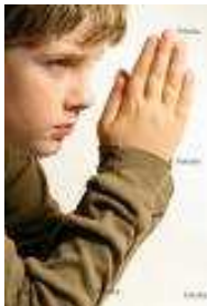
Priorities & Values