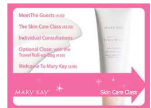
Training & More Training

If it's free, it's for me! Circle the car you would choose!