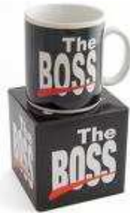
Be Your Own Boss