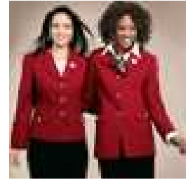
Fun & Friends