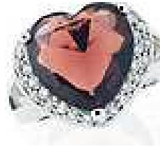
Prizes & Awards