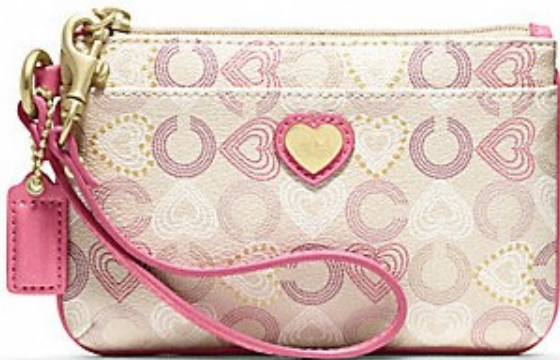
COACH Mini Wristlet