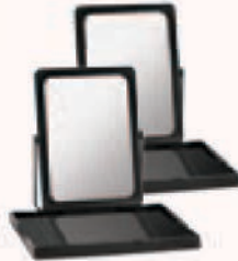
Two Mirrors With Trays