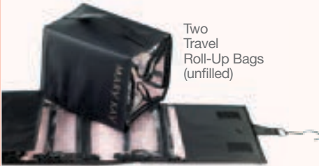
Two Travel Roll-Up Bags (unfilled)

Plus, earn a BizBuilder Bucks $125 wholesale product credit.**