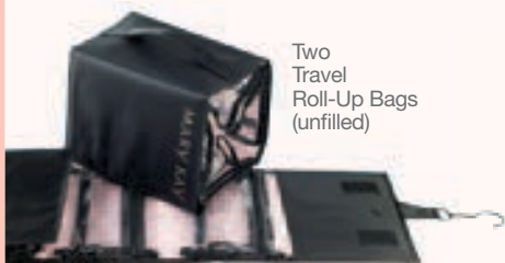
Two Travel Roll-Up Bags (unfilled)

Plus, earn a BizBuilder Bucks $80 wholesale product credit.**