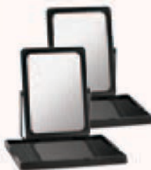
Two Mirrors With Trays