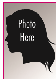
YVETTE RICE Sapphire Star