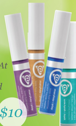
Mary Kay At Play™ Bold Fluid Eyeliner