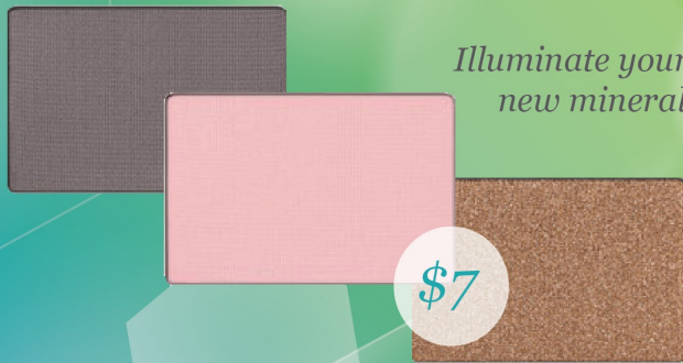
Illuminate your eyes with 5 new mineral neutrals