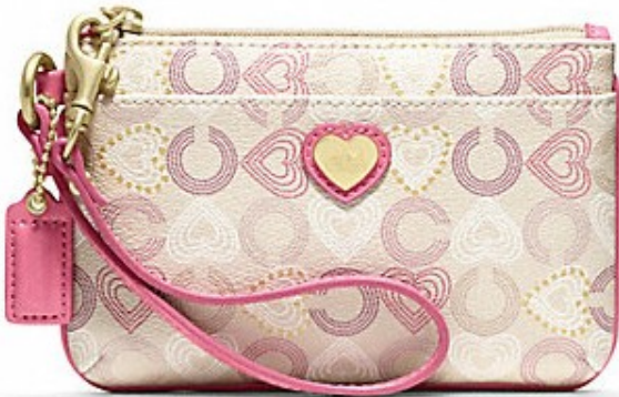
COACH Mini Wristlet