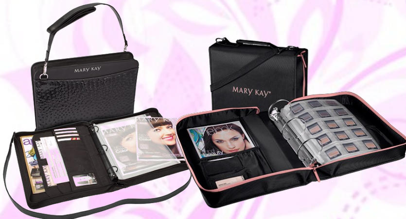
Mary Kay Business Organizer & Sample Organizer