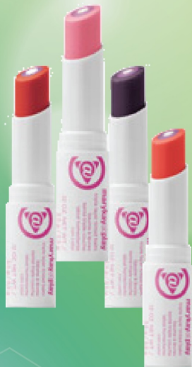
Triple Layer Tinted Balm