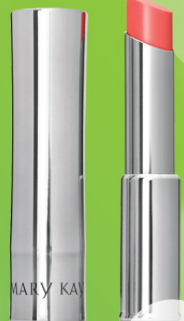
Glide on confidence with 10 new True Dimensions™