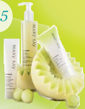
Honey Dew Satin Hands