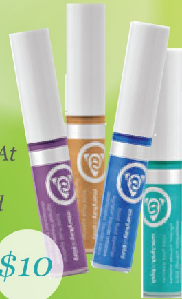
Mary Kay At Play™ Bold Fluid Eyeliner