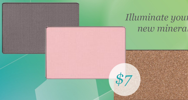
Illuminate your eyes with 5 new mineral neutrals