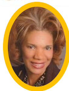
Joy = 6