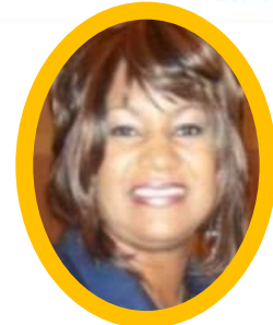
Satarro = 5